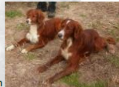
Pallas Green Flash Offspring (Australia)