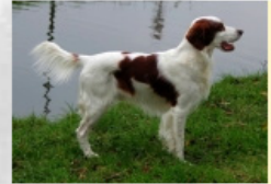
Pallas Green Ike Turner

Source: IRWS Pedigrees > Pallas Green H (12-11-2005) and I litter (30-06-2008) pedigree identical