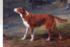
Ranger - AD 1797

Uncommon poss. Surprising color distributions ... even more possible in G1, G2 generation, there are many lovers for