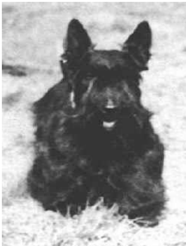
The Scottish Terrier bitch Scotch Rose